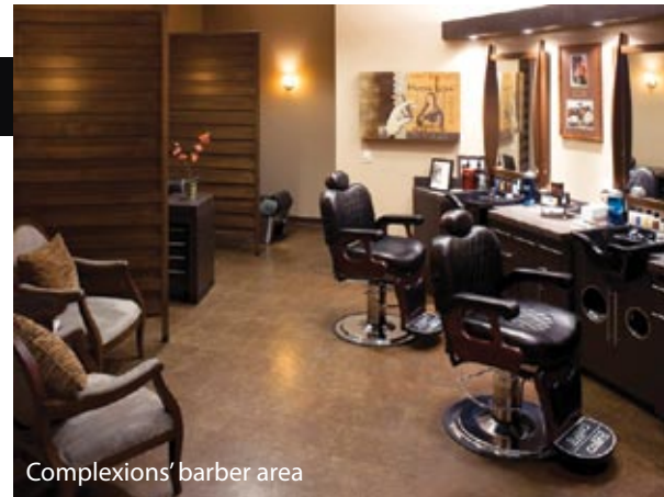
Complexions' barber area

NO MATTER WHICH PROTOTYPES FREQUENT YOUR SPA, YOU HAVE TO CONSIDER WHETHER YOUR FACILITY IS MAN-FRIENDLY ENOUGH TO LOOK LIKE HOME TO THEM.