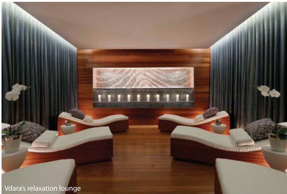
Vdara's relaxation lounge